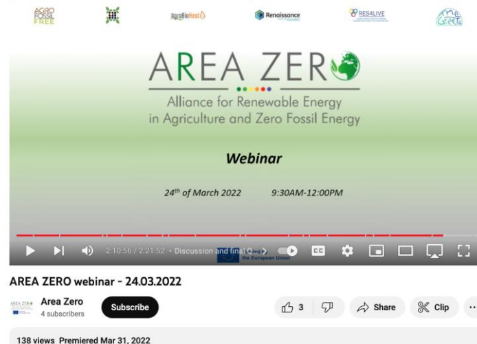
Figure 2. The AREA ZERO Cluster webinar is available on YouTube.

The AREA ZERO cluster has also a YouTube channel with 7 subscribers and 253 views where webinars organized amongst the different projects have been uploaded. During the webinars, each of the cluster members presented its goals and the corresponding achievements at that point, followed by a Q&A section before closing with a final concluding discussion and the future of the farming has been discussed.